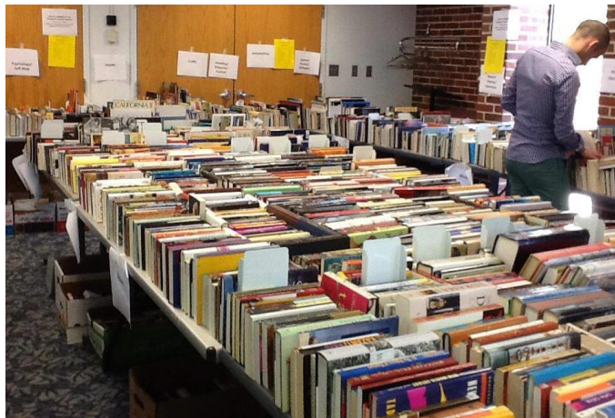
See you at the Book Sale!

Spread the word, and tell your friends that they do not need to be Duncan Library Friends to volunteer!